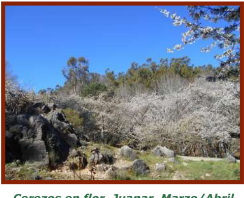
Cerezos en flor, Juanar. Marzo/Abril

Continue your walk along the left-hand side of the hills and. shortly, you will find yourself on the slopes of Cerro Lastonar. At 1,279 metres, this is the highest peak in Sierra Blanca. With a slight deviation to the right, we will reach the summit. The rest of the way to La Concha is the most beautiful part of the route. The ridge becomes a bit thinner and the hills give way to a more aerial path, to which you should pay special attention. After walking through La Cepilla de Enebro crossroad 12, where you go ahead on the left side, soon you will reach the peak of La Concha 14, from which you can admire the entire coast and the nearby Concepción reservoir.